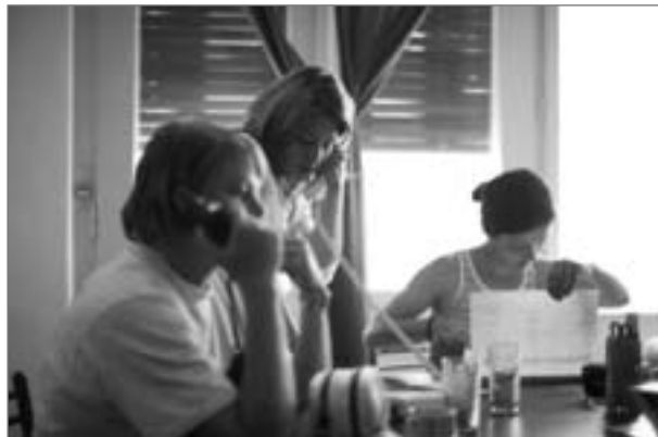
Activists at work, Shtip, Republic of Macedonia

At a national level, it is also very important to develop initiatives for the determination of a legal minimum wage and for the formulation of equal pay for equal work legislation.