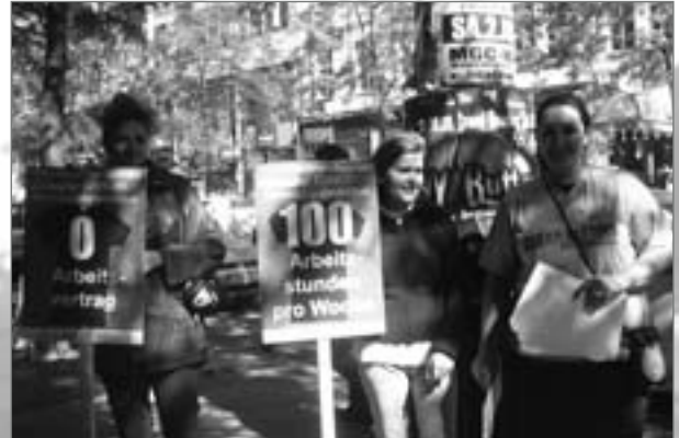
An action at Vienna's center shopping street

"Working relationships shall be legally binding and all obligations to employees under labour or social security laws and regulations shall be respected."